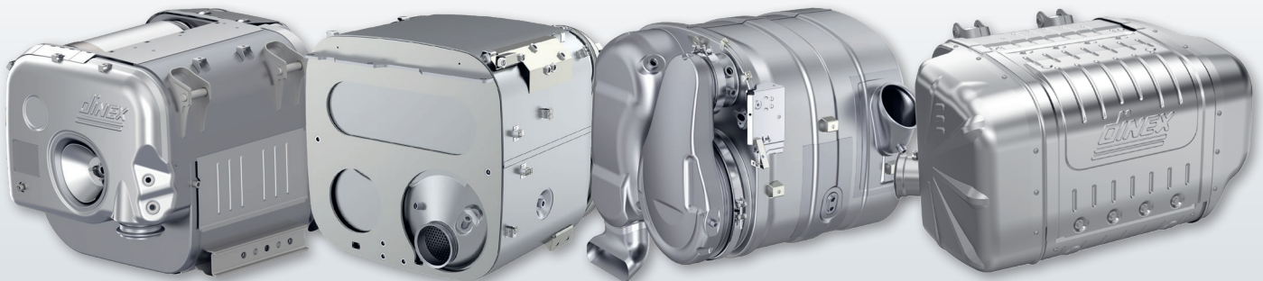
Euro VI Silencer for IVECO STRALIS