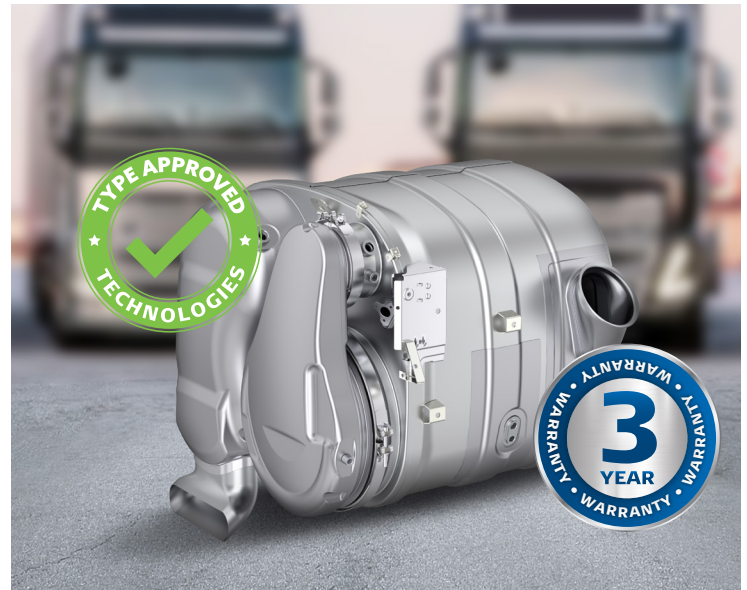
Dinex OneBox for Euro VI Volvo/Renault trucks.