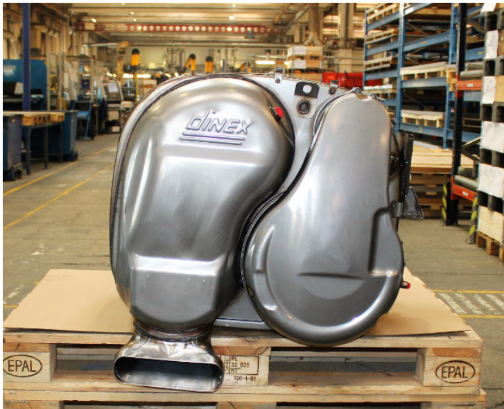
First Dinex OneBox prototype for Euro VI Volvo/Renault trucks.