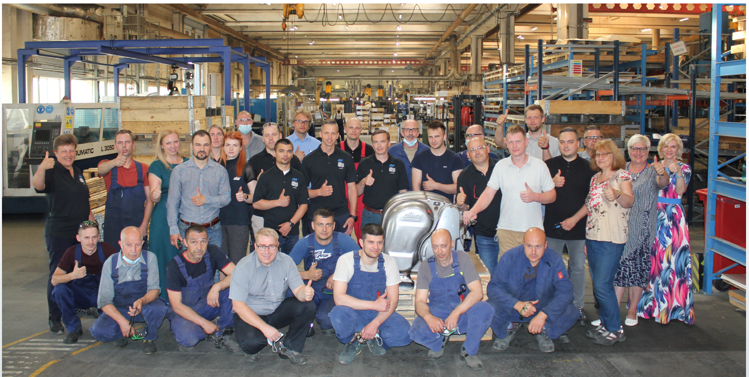
A proud production and development team in Dinex Latvia.