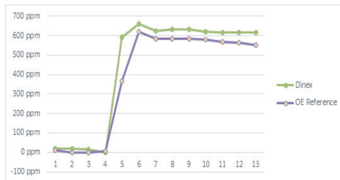
Test of Dinex vs. OE sensors, showing equal accuracy.

Check out our web page to find more information about NO x sensors and the whole mechatronics product range (product lists, video series, frequently asked questions, and more).