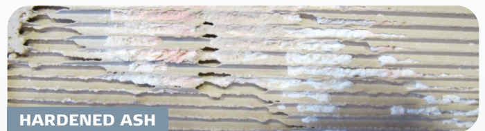
HARDENED ASH Cut-through of a filter after it went through a 2-stage cleaning. The white residues remains, and will continue to partially block the exhaust flow.

Durability: Hardened ash increases mechanical and thermal stress of the DPF. As traditional cleaning fails to remove this, a DPF is rarely expected to endure more than 1.000.000 km of operation, but with reconditioning it is not uncommon that it lasts up to twice as long.