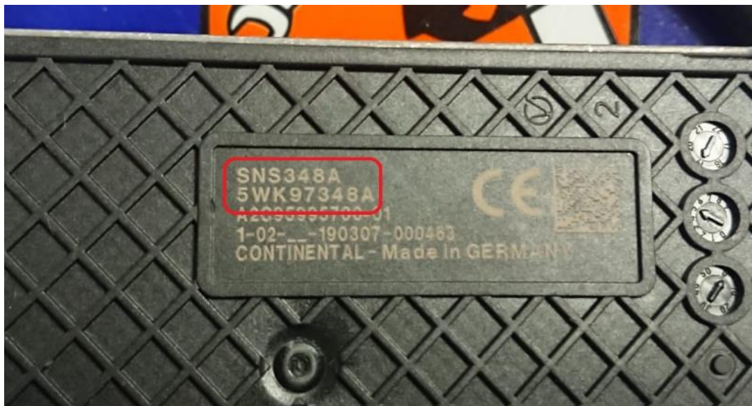
Fig. 3. Continental No. (found on OE sensor)