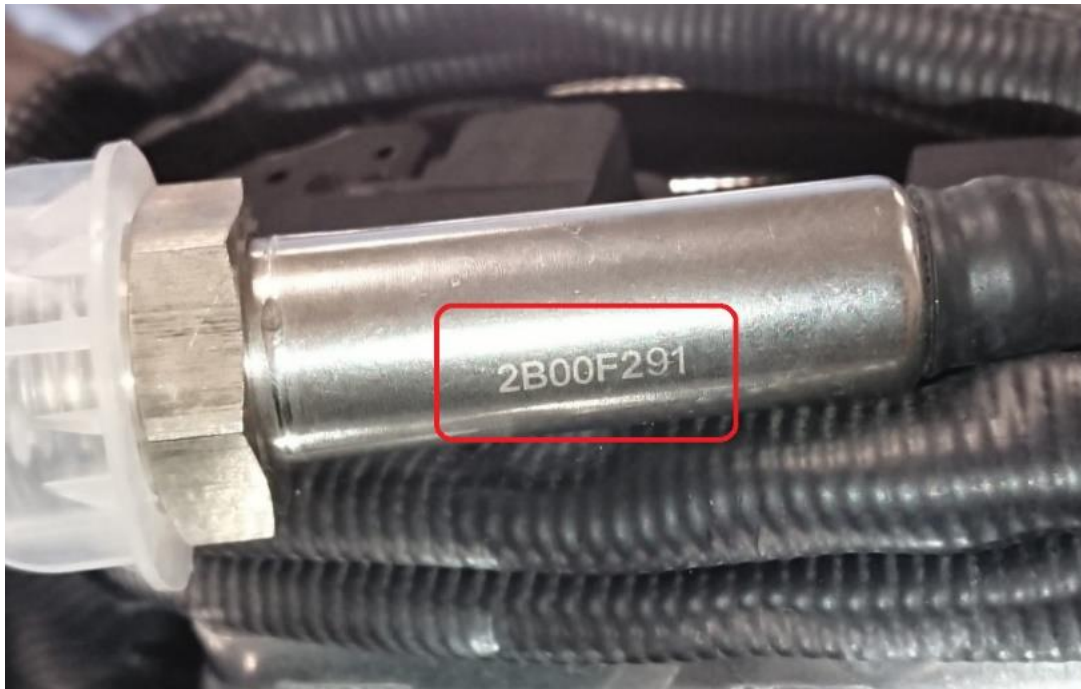
Fig. 2. Sensor head No. (Dinex sensor)