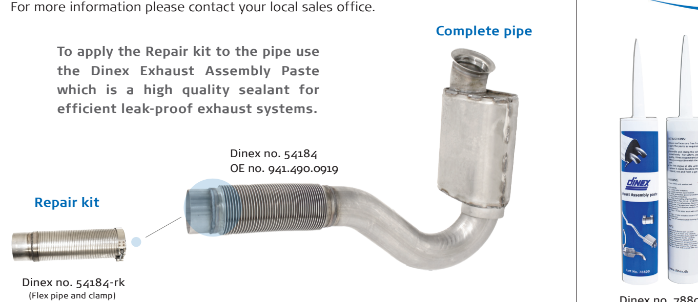
Dinex no. 78800 Dinex Exhaust Assembly Paste

Dinex is pleased to introduce the aftermarket with the pipe rep-kit for Renault Midlum. The Repair Kit gives the opportunity to easily repair the pipe without additional costs. In addition to that Dinex offers full range of pipes for Mercedes Axor Euro III. For more information please contact your local sales office.