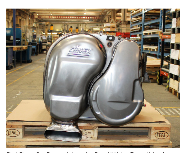
First Dinex OneBox prototype for Euro VI Volvo/Renault trucks.