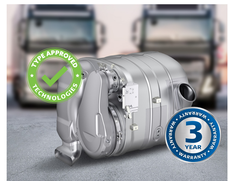
Dinex OneBox for Euro VI Volvo/Renault trucks.