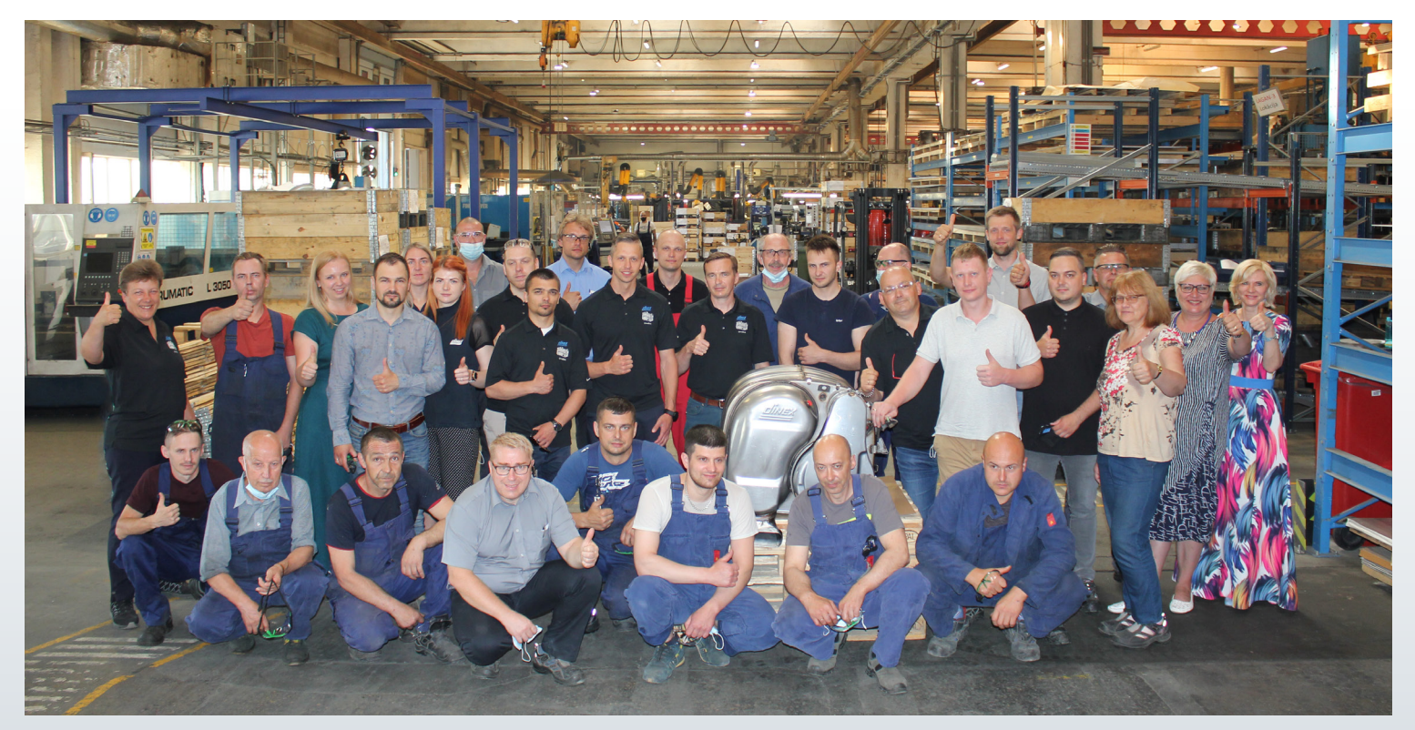
A proud production and development team in Dinex Latvia.